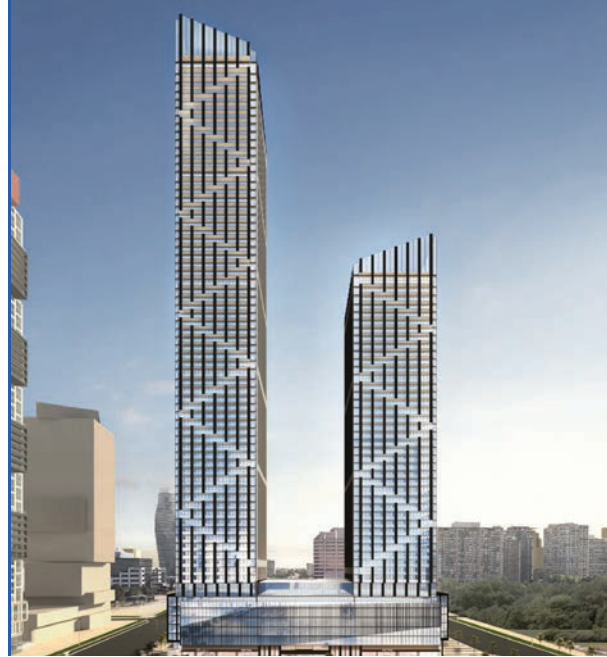
180 BURNHAMTHORPE Mississauga | 1,064 Units (Under Development)