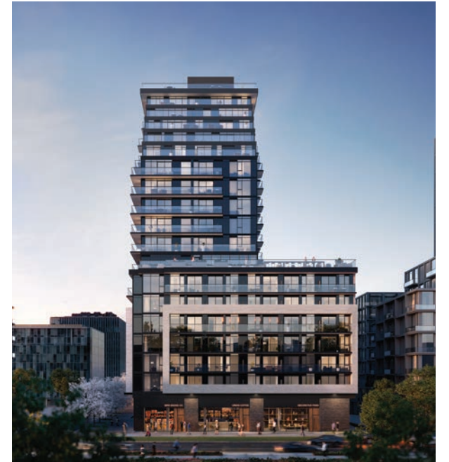
ARTE Mississauga | 427 Units (Under Construction)