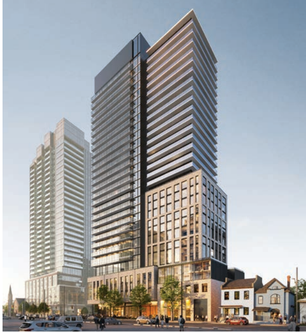
92 JOHN ST. Hamilton | 306 Units (Under Development)