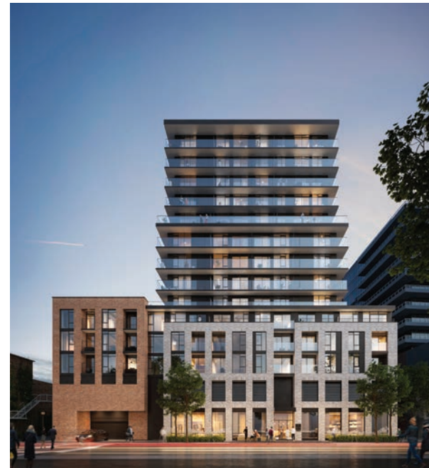
1 JARVIS Hamilton | 354 Units (Under Construction)