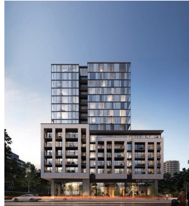
ARTFORM Mississauga | 336 Units (Under Construction)