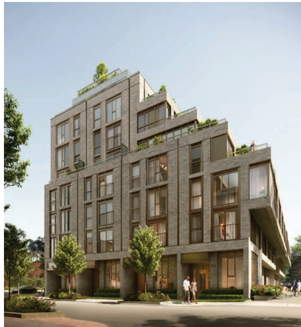
LEASIDE Toronto | 241 Units (Sales Commenced)