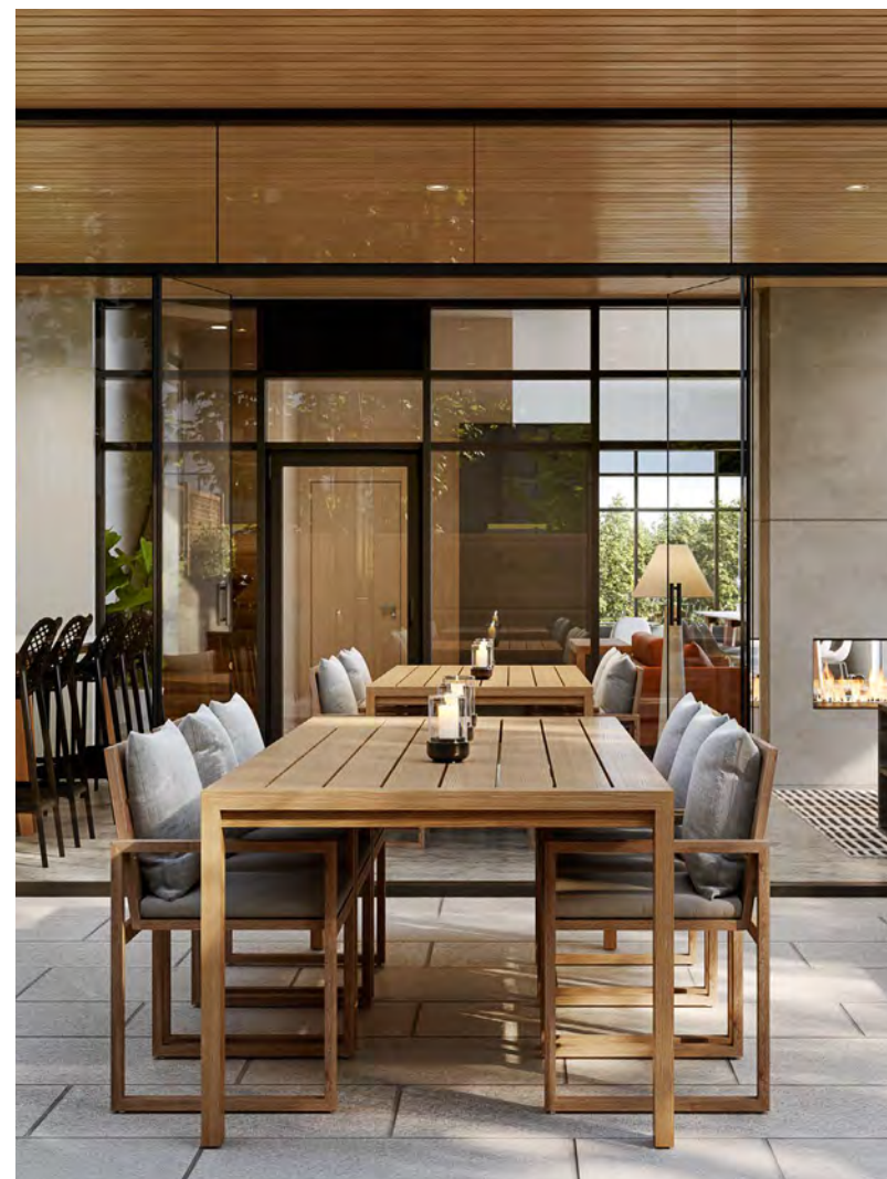
Carding House, Oakville