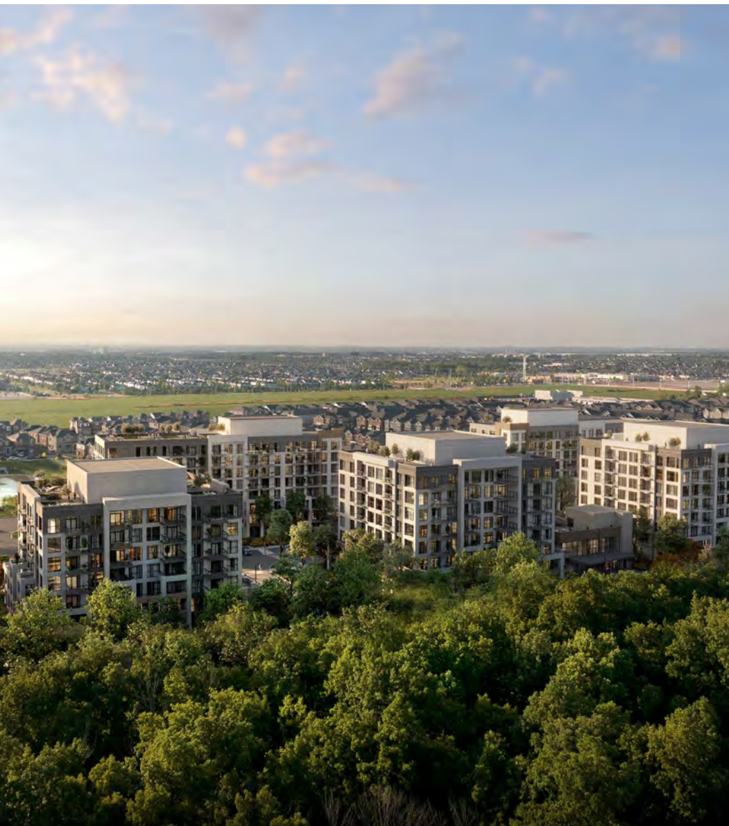
Mile & Creek, Milton

Step into the extraordinary at The Laurels by Mattamy Homes, where a meticulously planned neighbourhood blends urban vibrancy with the embrace of suburbia in Milton.