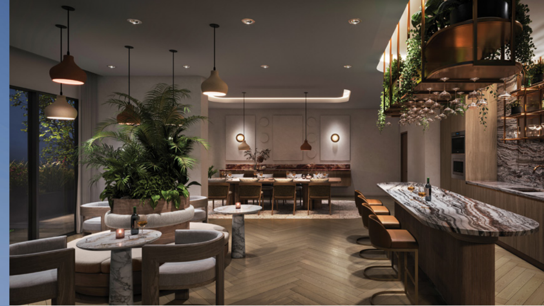
Entertainment Kitchen & Dining Area

All renderings, landscaping and images are Artist's Concept Only.