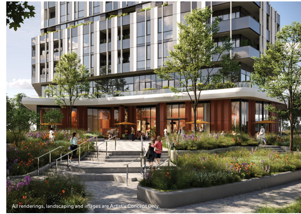
All renderings, landscaping and images are Artist's Concept Only.