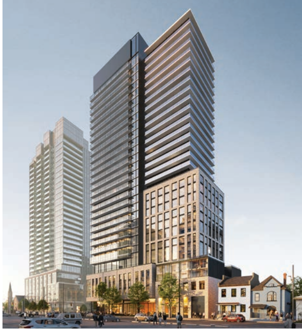
180 BURNHAMTHORPE Mississauga | 1,064 Units (Under Development)