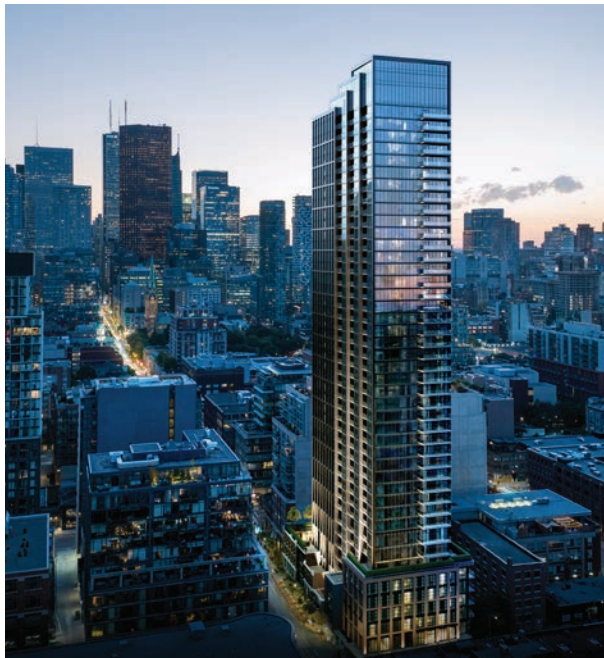
LEASIDE Toronto | 241 Units (Sales Commenced)